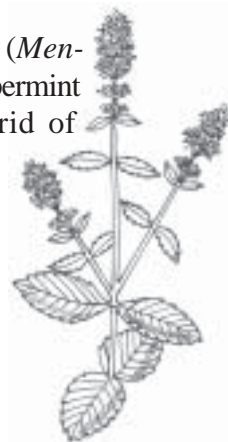
Mentha piperita (Peppermint)

• Peppermint ( Mentha piperita ): Peppermint is a natural hybrid of spearmint. Peppermint is an antiseptic and antibacterial agent. Over 30 pathogenic microorganisms are inhibited by its presence. Peppermint is also anti-inflammatory in nature.