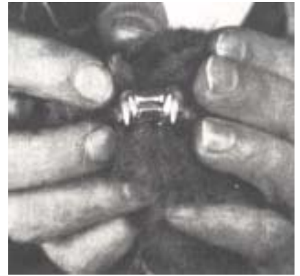
Tooth alignment in a cat raised on a natural, raw meat-based diet.