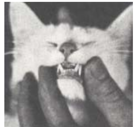
Severe tooth malalignment in a cat raised on processed food.