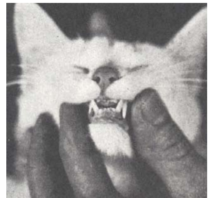
Severe tooth malalignment in a cat raised on processed food.