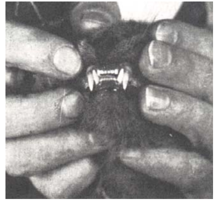
Tooth alignment in a cat raised on a natural, raw meat-based diet.